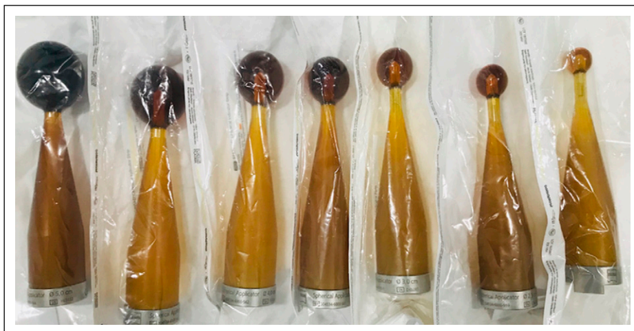
FIG 2. IORT Intrabeam 50kV, Carl Zeiss Surgical, Oberkochen, Germany applicators ball types.

Before administering the TARGIT-IORT treatment regimen, distance (43.9%) and choice (40.2%) were reported as the patients' indication and primary reasons for opting to undergo TARGIT-IORT ( Table 2 ). Patients were more willing to choose IORT/TARGIT-IORT because of delayed treatment times at EBRT machines, potential contact at hospital treating facilities, and general unease during the COVID-19 period. A recurrence rate of 1.9% (two of 107) was reported. A complication rate of 2.8% (three of 107), defined as major complications (fat necrosis and/or skin erythema), was reported.