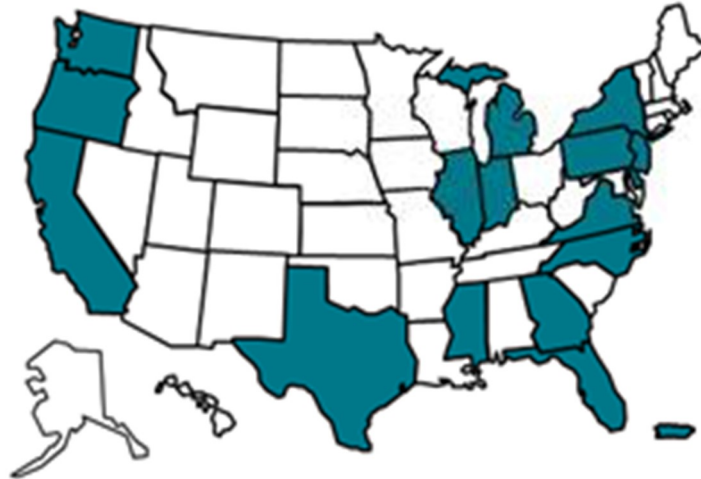
Fig 1. Map of areas participating in MMP. Note: These 23 areas were funded to conduct data collection for the 2015 cycle: California (including the separately funded jurisdictions of Los Angeles County and San Francisco), Delaware, Florida, Georgia, Illinois (including the separately funded jurisdiction of Chicago), Indiana, Michigan, Mississippi, New Jersey, New York (including the separately funded jurisdiction of New York City), North Carolina, Oregon, Pennsylvania (including the separately funded jurisdiction of Philadelphia), Puerto Rico, Texas (including the separately funded jurisdiction of Houston), Virginia, and Washington.

https://doi.org/10.1371/journal.pone.0243351.g001