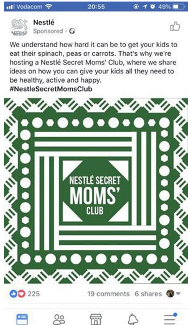
Figure 4 Example of a Facebook post by a Nestlé Facebook page that violates provision 7 (5) of the regulation R991. 31

The above example ( figure 3 ) is a direct violation of Regulation R991, as no companies can provide information to the public on IYCN. This is covered in Provision 7 (5) which states the following: 7 (5) No manufacturer,