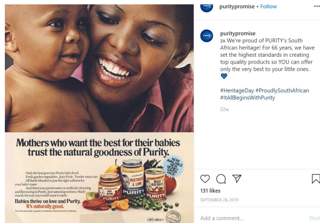
Figure 2 Example of an Instagram post from purity that violates provisions 2 (1) and 3 of the SA regulation R991. 30 SA, South Africa.

Provision 7 (1) of the Regulation R991 states that ‘No person shall undertake or participate in any promotional practice in respect of (BMS); 7 (2) Promotional practices or devices in respect of the products listed in sub-regulation 7 (1) include, but are not limited to: ... Direct/indirect contact between company personnel and members of the public in furtherance of or for the purpose of promoting the [BMS-related] business of the company... ; Indirect contact includes internet sites hosted on behalf of an SA entity, television and radio, telephone or internet help lines, mother and baby clubs but excludes contact w.r.t. product quality complaints...’. 2 By inviting mothers to join a conversation on an instant messaging platform (WhatsApp), a BMS manufacturer (Nestlé) is clearly inviting direct/indirect contact between their company’s personnel and members of the public (in this case, it clearly states ‘moms’). According to Provisions 7 (1) and 7 (2), this should not be allowed to take place. The example described is, therefore, a direct violation of the SA Regulation R991. This type of practice takes place regularly by this BMS manufacturer