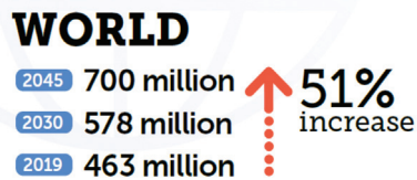
Figure 2. Prediction of increase in diabetes worldwide.

factors, among which are age and body mass index. These varied from 5.0% (eutrophic) to 60.0% (obese), as well as 10.0% (20- to 29-year-old) to 45.0% (60- to 69-year-old), respectively. 8