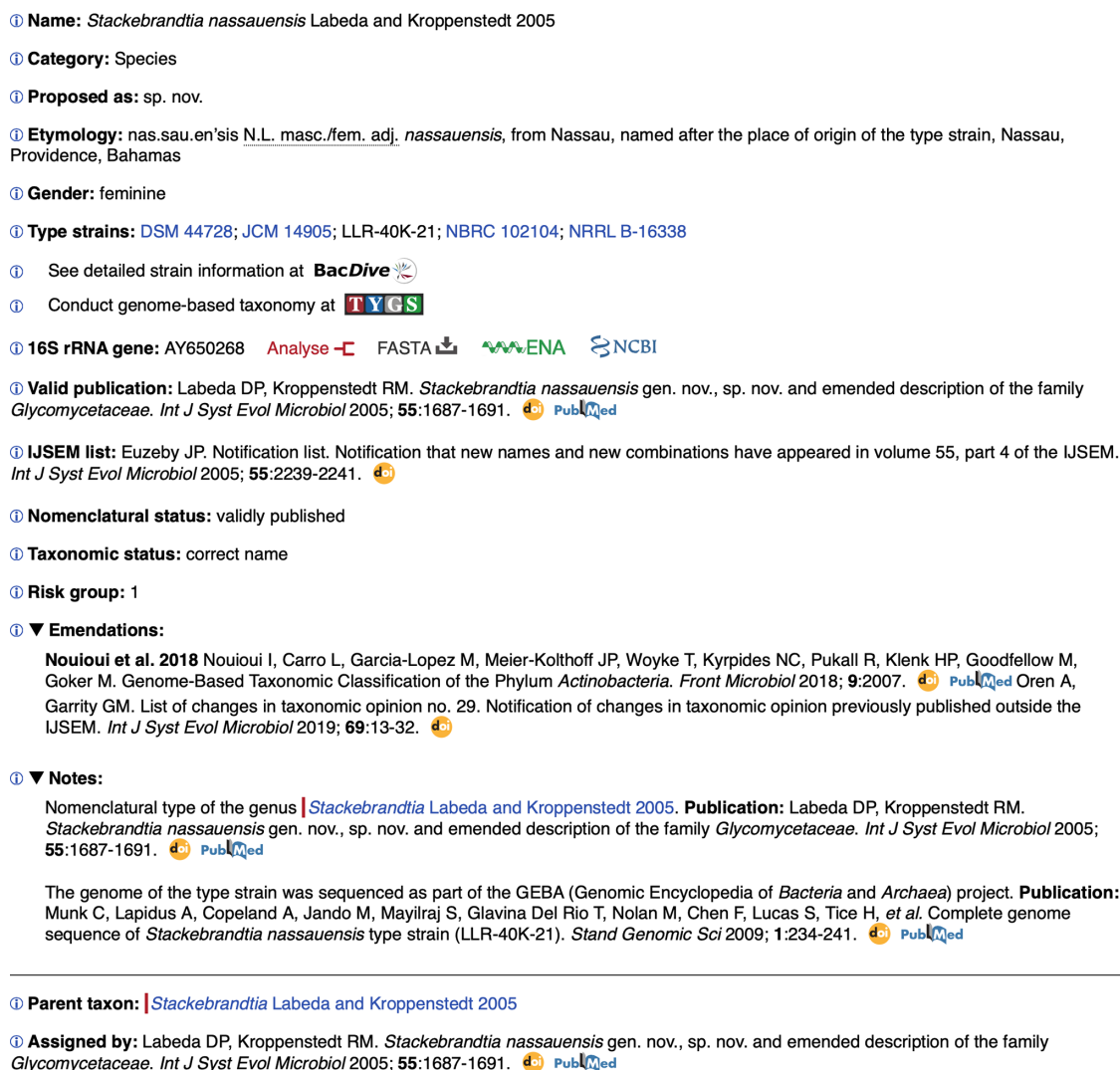
Fig. 4. Sample taxon page in the LPSN showing information on the species Stackebrandtia nassauensis .

The parent taxon name and defining publication are provided, and a reference to the article that assigned the taxon to its parent. The reference for the assignment of a species to a genus or a subspecies to a species is trivially identical to the reference that proposed the species or subspecies name because the genus name is part of a species name and the species name is part of a subspecies. This does not hold for the assignment of a genus to a family, of a family to an order, of an order to a class, etc. For this reason, the publication which assigned a certain child taxon above species rank to a certain parent taxon is not obvious from the name of the child taxon. The LPSN thus separately cites the publication in which the assignment of a child taxon to a parent taxon is found.