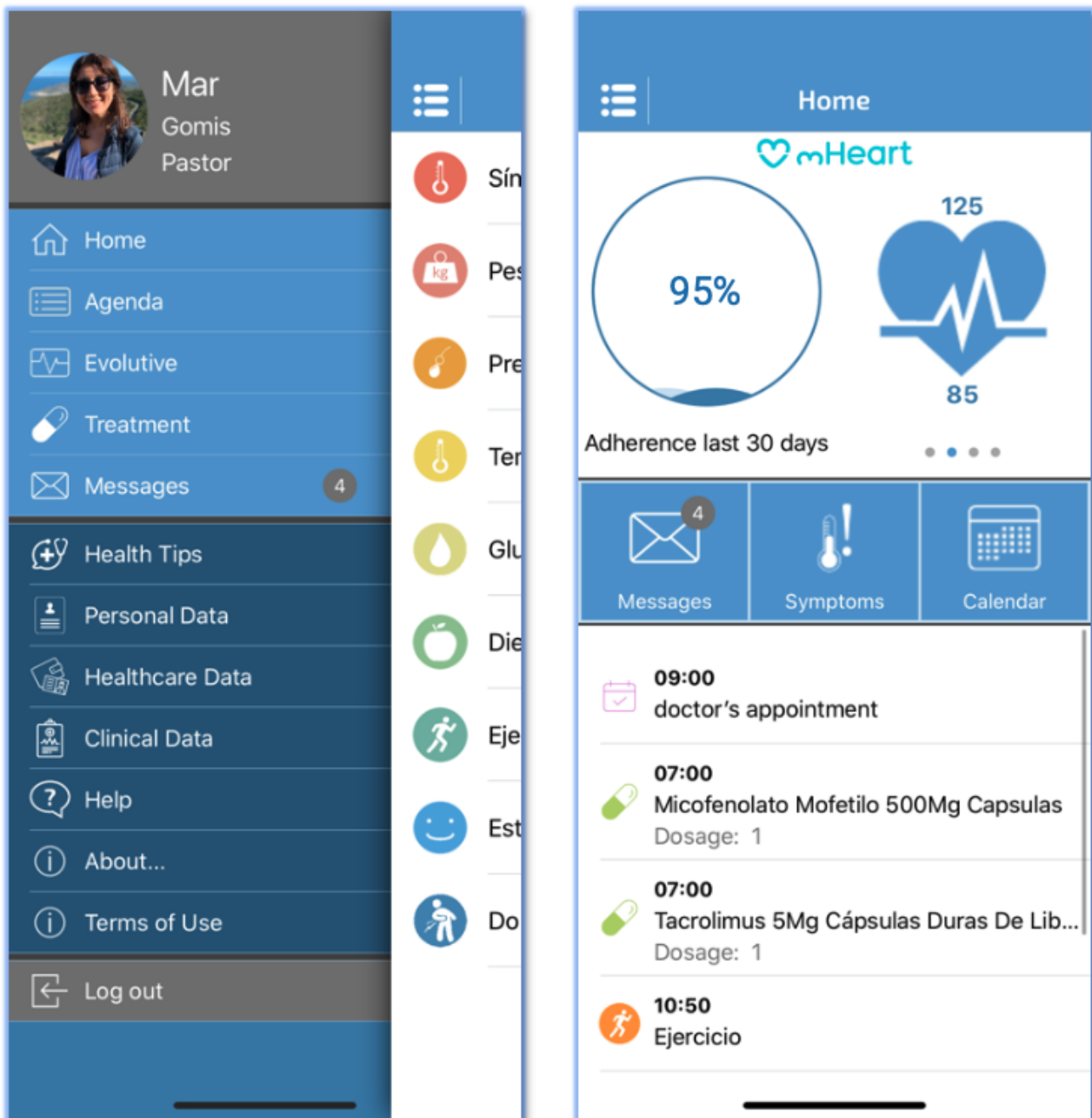
Figure 1. The mHeart system menu, displaying the different app modules: Treatment, Agenda, Self-control, Symptoms, Messaging, Health Education and Advice, Personal and Clinical Data.

Outlining the methodology used, principal findings, and the barriers and facilitators encountered in usual clinical practice could be highly useful for new developers and could be generalizable in other contexts. Therefore, this article may guide other health providers in the implementation of holistic and interdisciplinary internet-based strategies to improve clinical practice.