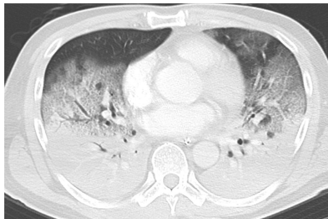
Fig. 1. Chest computed tomography scan showed a bilateral consolidation with lower lung predominance. Bulla or emphysema was not observed.

SEVERE COVID-19 pneumonia can progress to ARDS. 1 ARDS could result in a low lung compliance and requires severe ventilator settings, eventually leading to ventilator-induced injury and pneumothorax. 2 Furthermore, some reports advocated that alveolar damage owing to COVID-19 pneumonia could be associated with pneumothorax. The pathological features of patients with severe COVID-19 pneumonia showed bilateral diffuse alveolar damage with cellular fibromyxoid exudates, desquamation