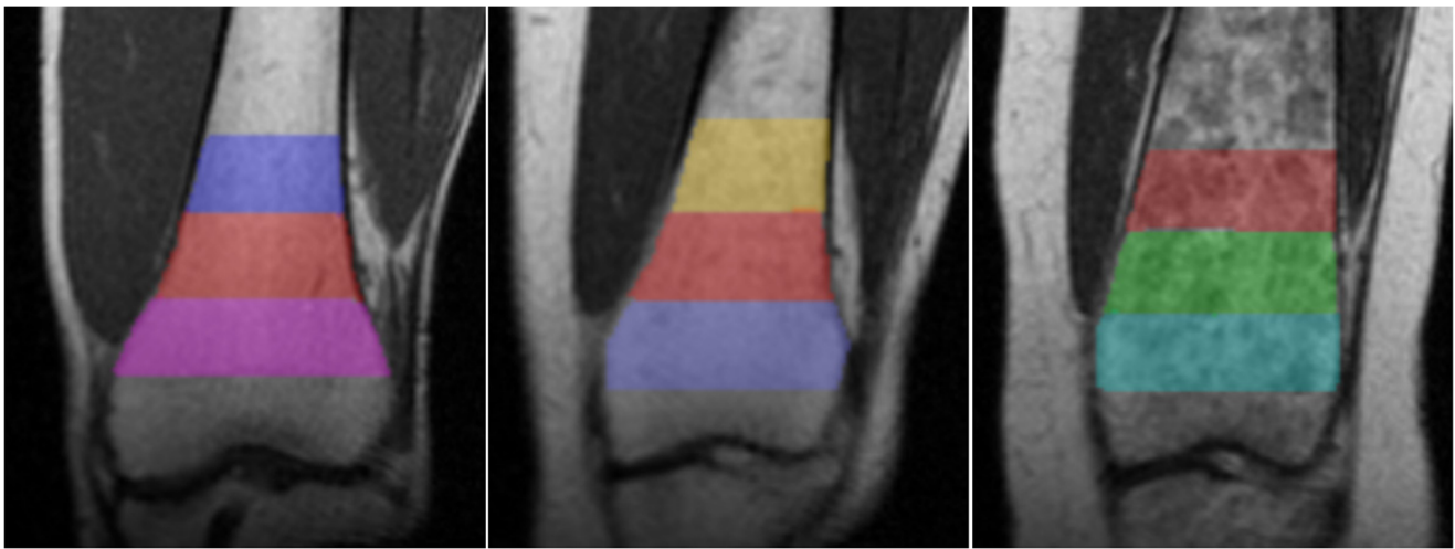
Fig. 1 Distal femur ROIs to capture the Erlenmeyer flask deformity. Three ROIs were drawn for each femur: physis to 2 cm above the physis, 2 cm to 4 cm above the physis, and 4 cm to 6 cm above the

physis. Note that each femur has a different degree of metaphyseal flaring. The left image is a femur rated “No EFD”, the center “Mild EFD”, and the right “Severe EFD”