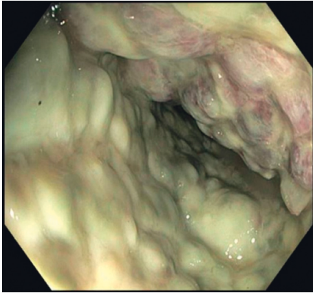
FIGURE 3: Midsigmoid colon showing extension of the severe colitis to the midsigmoid region.

medications and novel therapy. However, to date, we are aware of two other cases of de novo colitis associated with ocrelizumab, with one of them requiring surgical resection [2, 3].