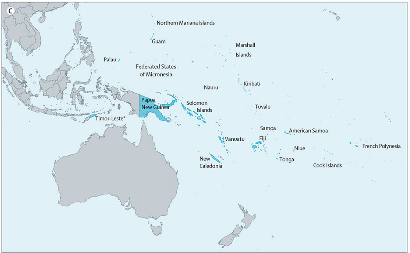
Figure: Map of the UN small island nations