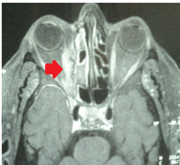
Fig. 2. Facial MRI (sagittal Section) showing filling of the ethmoidal cells with an intra-orbital contrast grafting (red arrow). (For interpretation of the references to colour in this figure legend, the reader is referred to the web version of this article).

resolution of radiological abnormalities. The patient was discharged with a complete recovery.