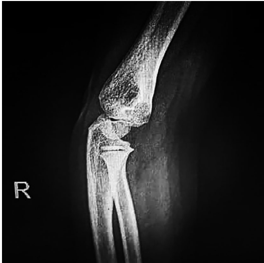
FIGURE 3 The X-ray arthritis view in the right elbow is showing the typical bony structures, no visible posterior and anterior fat pad, and no elbow effusion