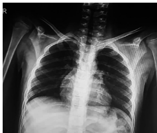
FIGURE 2 The chest X-ray presentation

The microorganism's role in acute and chronic arthritis manifestation has not yet been fully elucidated through recent studies. Host aberrant immune response against pathogens and microorganisms colonization in joints could be involved. 6 Few studies investigated the link between respiratory viruses and rheumatoid arthritis (RA), and particularly in a Korean study, the association between Parainfluenza