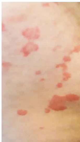
FIGURE 1 Urticaria view in the abdomen

The mild kidney impairment also was observed with a BUN of 32 mg/dL and creatinine of 1.5 mg/dL and then decreased to 14 and 0.43 mg/dL, respectively, three days after hydration therapy. The sodium and potassium levels were 134 and 3.5 meq/L, respectively. Urine analysis was normal. Stool examinations for ova and parasites and occult blood were normal. Wright's test was negative. Knee joint aspiration was done, which was a dry tap without any joint fluid. Aspartate aminotransferase and alanine aminotransferase were 11 and 17 U/L, respectively, and higher levels of alkaline phosphatase (694 IU/L) were observed. 3 The Prothrombin Time and INR were intact. Sonographic findings of the abdomen were