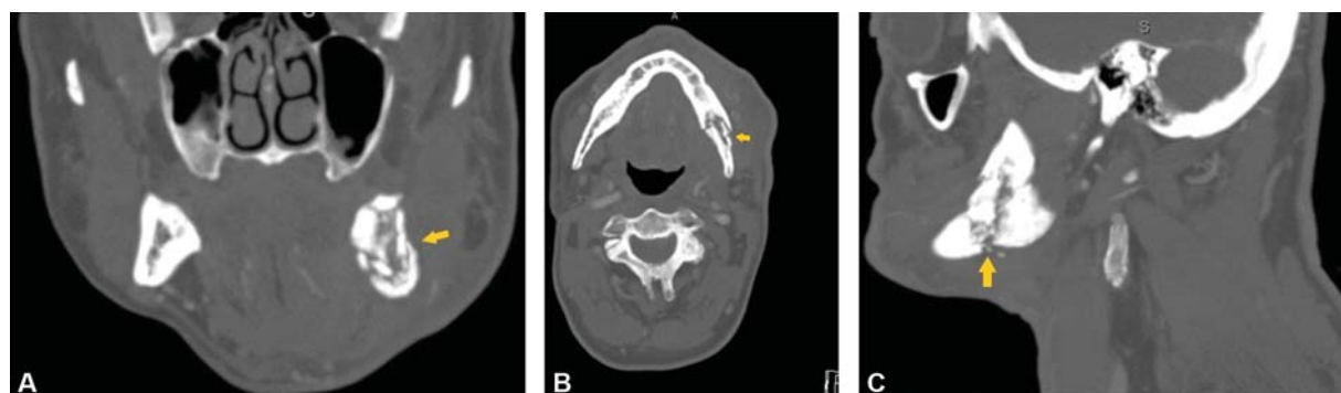
Fig. 1 Radiographic images of left-sided mandibular osteoradionecrosis. Left mandibular angle pathological fracture (yellow arrow) can be seen with bony resorption and loss of cortical bone. (A) Coronal view. (B) Axial view. (C) Sagittal view.

Although there is currently no uniform staging system for classifying ORN, several have been proposed over the years.