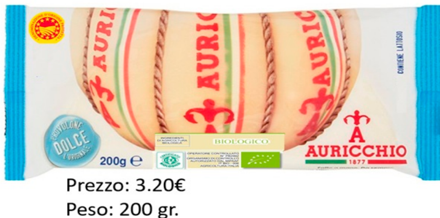
Figure 1. Example of evaluated cheese profile.

An example of one of the 16 obtained profiles is shown in Figure 1.