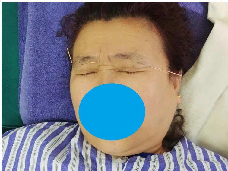
Figure 1 Eye acupuncture point location.