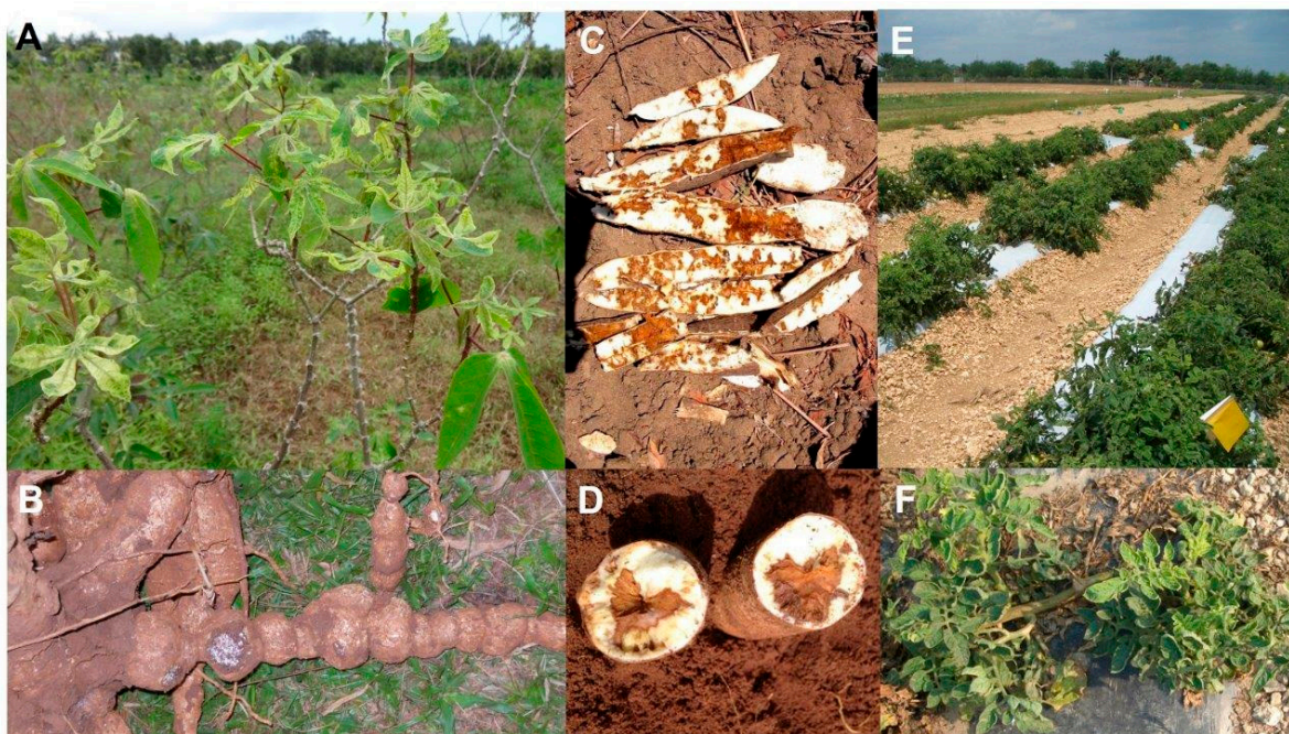
Figure 1. (A) Field of cassava devastated by cassava mosaic disease. Remaining upper leaves on diseased, mostly defoliated plants show symptoms consisting of severe mosaic and leaf deformation, image modified from [7]. (B) Roots of cassava showing marked constrictions caused by cassava brown streak disease (CBSD) (image credit @Natural Resource Institute/Maruthi Gowda). (C) Tuberous roots of cassava cut along their lengths showing dry necrotic rotting caused by CBSD (image credit @Natural Resource Institute/Maruthi Gowda). (D) Tuberous roots of cassava cut in cross section of showing dry necrotic rotting caused by CBSD (image credit @Natural Resource Institute/Maruthi Gowda). (E) Field of tomato devastated by tomato yellow leaf curl disease (TYLCD). All plants have symptoms of diminished leaf size, bunched growth, plant stunting, and lack of fruit formation, image modified from [5]. (F) Tomato plant showing severe symptoms of small, pale and upcurled leaves, bunched growth and plant stunting caused by TYLCD following early growth stage infection.