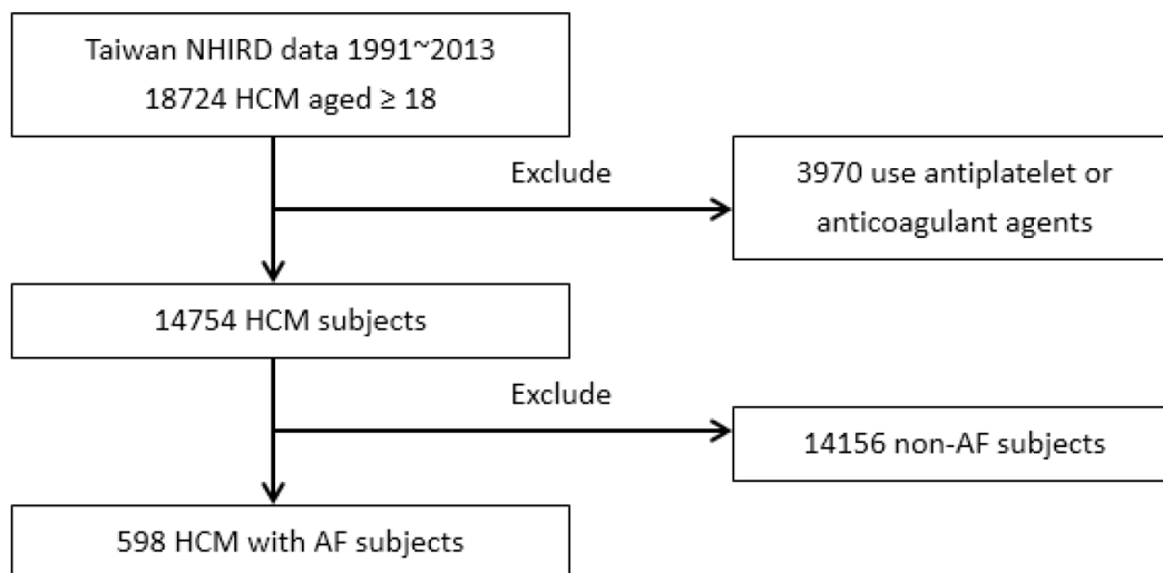
Figure 1. Enrollment of patients with HCM and AF.

Abbreviations: DM, diabetes mellitus; CKD, chronic kidney disease; PAOD, peripheral arterial occlusive disease; CHF, congestive heart failure; CAD, coronary artery disease; TIA, transient ischemic attack; CCB, calcium channel blocker; ACEI/ARB, angiotensin-converting enzyme inhibitor/angiotensin receptor blocker