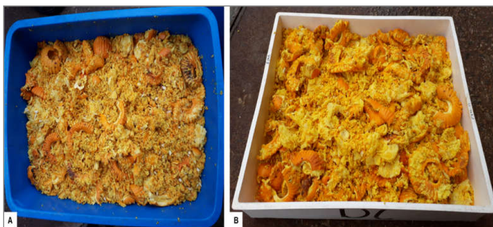
Figure 2. Citrus pulp generated from processing ‘Midnight’ Valencia oranges. (A) Pulp in a container and left overnight after fruit processing. (B) Pulp spread flat in an open tray and exposed to natural conditions.

Batches of treated and untreated (lemons and oranges) fruit were processed for juice extraction (JBT Citrus Juice Extractor, John Bean Technologies (Pty) Ltd., Cape Town, South Africa). The citrus pulp was in the form of peel segments, rag, and seeds (Figure 2). After fruit processing, the pulp was left overnight in containers (Figure 2A) and was then spread flat (layer of ±4 cm thick) in open trays (measuring 52 cm × 41 cm × 8 cm) the next day (Figure 2B). The pulp in different trays was exposed to sunlight either for 1, 2 or 3 days before 100 intact CBS lesions were counted from the peel segments that were exposed to sunlight (i.e., on the top of the layer) and a score was made regarding whether pycnidia were present or absent on each lesion. Lesions were also counted from pulp not exposed to sunlight (0 days). Twenty lesions with pycnidia, from each tray, were then investigated for pycnidiospore release and pycnidiospore germination. Seven trays with pulp were used for each sun-exposure period for both treated and untreated lemons and oranges. Trials were conducted once on lemons and repeated on oranges.