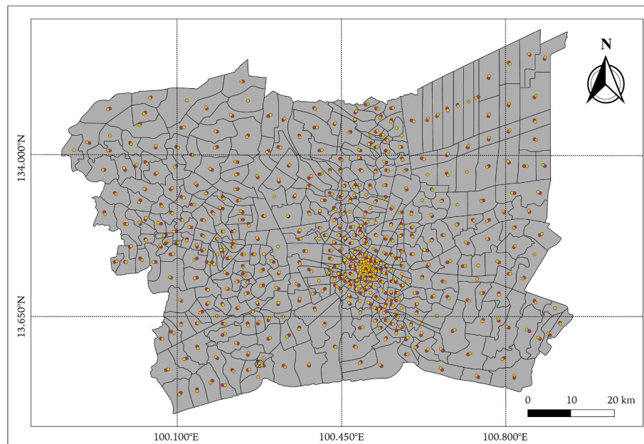
Fig. 3. The grid of nearest centroid point of each district in the study area (BMR).

leave-one-out cross validation R^2 value of 0.99 for PM_{10} , O_3 , NO_2 , SO_2 , and 0.98 for CO. Model predictions had little bias, with cross-validated slopes (predicted vs observed) of 0.99 for PM_{10} , O_3 , NO_2 , SO_2 , and 0.98 for CO.