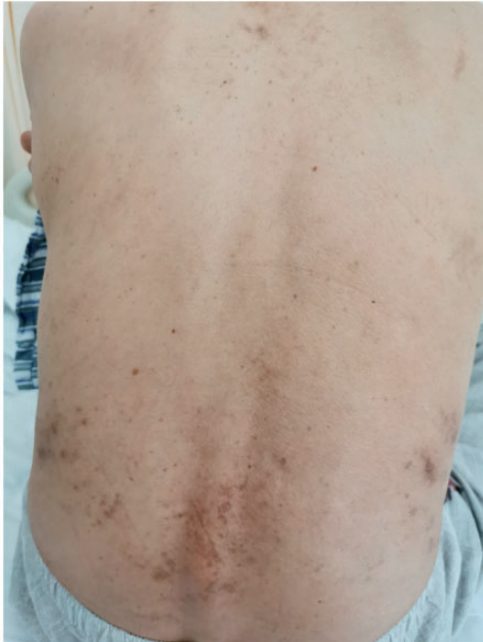
Figure 4. Photograph showing the resolving erythema on the patient's back.

day. One month after discharge, we re-evaluated the patient, and the erythema on her back, hands, and feet had resolved well.