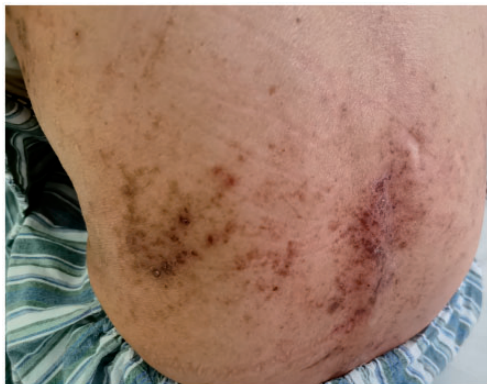
Figure 2. Photograph showing the acute stage of erythema on the patient's back.

therapy. At this point, the clinicians and a pharmacist considered an association between the chemotherapy drugs and the adverse events, caused mainly by the liposomal doxorubicin. According to the Common Terminology Criteria for Adverse Events (CTCAE) version 5.0, 3 the patient's adverse reaction was diagnosed as grade 3; HFS caused by liposomal doxorubicin.