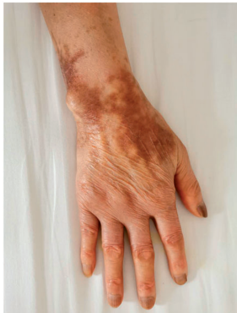
Figure 3. Photograph showing the resolving erythema on the patient's right hand.

Currently, there are no standard guidelines for the prevention and treatment of HFS caused by liposomal doxorubicin. Corticosteroids and nonsteroidal anti-inflammatory drugs are generally accepted drugs that can decrease the inflammatory response. According to the manufacturer's drug insert for liposomal doxorubicin, some patients suffering liposomal doxorubicin-related PPE require oral dexamethasone or topical corticosteroid. Urea cream, hydrocortisone butyrate cream (us. ext., tid) and celecoxib capsules (p.o., 100 mg, bid) were prescribed for the patient. After 14 days of treatment, the erythema on her hands and feet had obviously disappeared, and all blisters had dried and crusted. Pruritus and edema-associated pain were also relieved (Figure 3 and Figure 4). After her symptoms improved,