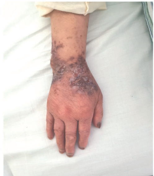
Figure 1. Photograph showing the acute stage of erythema on the patient's right hand.

9 January 2020. The second, third, and fourth chemotherapy treatments were given on 3 February, 24 February, and 16 March 2020, respectively. On 30 March 2020, large areas of erythema, ulceration, and exudation appeared on her back, hands, and feet (Figure 1 and Figure 2). On 13 April and 4 May 2020, the patient received single chemotherapy with liposomal doxorubicin (40 mg, qd, IV drip infusion), but the erythema did not improve. The clinicians then consulted a dermatologist who considered that the lesions represented Tinea corporis infection. Calamine lotion and terbinafine cream were prescribed as treatments, but the patient reported no improvement after 1 week of