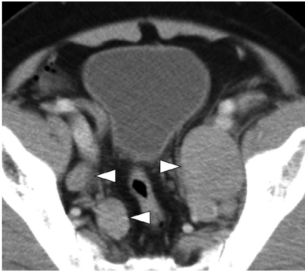
Fig. 1 CT image at presentation showing multiple swollen pelvic lymph nodes (arrowheads).

occult primary digestive tract cancer, 8 the patient received S-1 40 mg/m 2 on days 1–14 and oxaliplatin 100 mg/m 2 on day 1 (SOX therapy). After one course of SOX therapy, the maximum diameter of the prostate showed enlargement from 56 to 61 mm in addition to increasing size of pelvic lymph nodes. In addition, FDG-PET/CT showed the uptake in the prostate in a retrospective view. Therefore, prostate biopsy was performed and it revealed undifferentiated carcinoma, showing similar characteristics as the para-aortic lymph node cells, except for weakly positive PSA staining (Fig. 2). On the basis of these findings, the patient was diagnosed with undifferentiated prostate cancer, cT3aN1M1a.