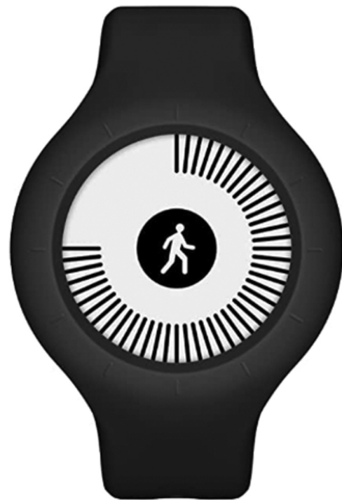
Fig. 2 Withings go activity tracker.

research assistant. As the avatar climbs the heart mountain, each step triggers information, problem-solving challenge (e.g., quizzes), mini-game (word puzzle or slot game), or bonus wheel spin for extra points (→ Fig. 3).