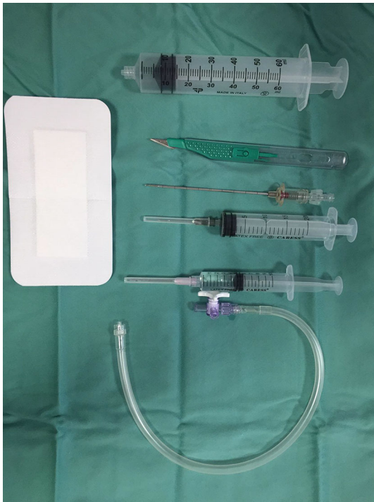
Fig. 2 Instruments for bedside pneumoperitoneum induction

lobectomy, one a left superior lobectomy, one a left atypical resection and the last patient underwent pleural drainage.