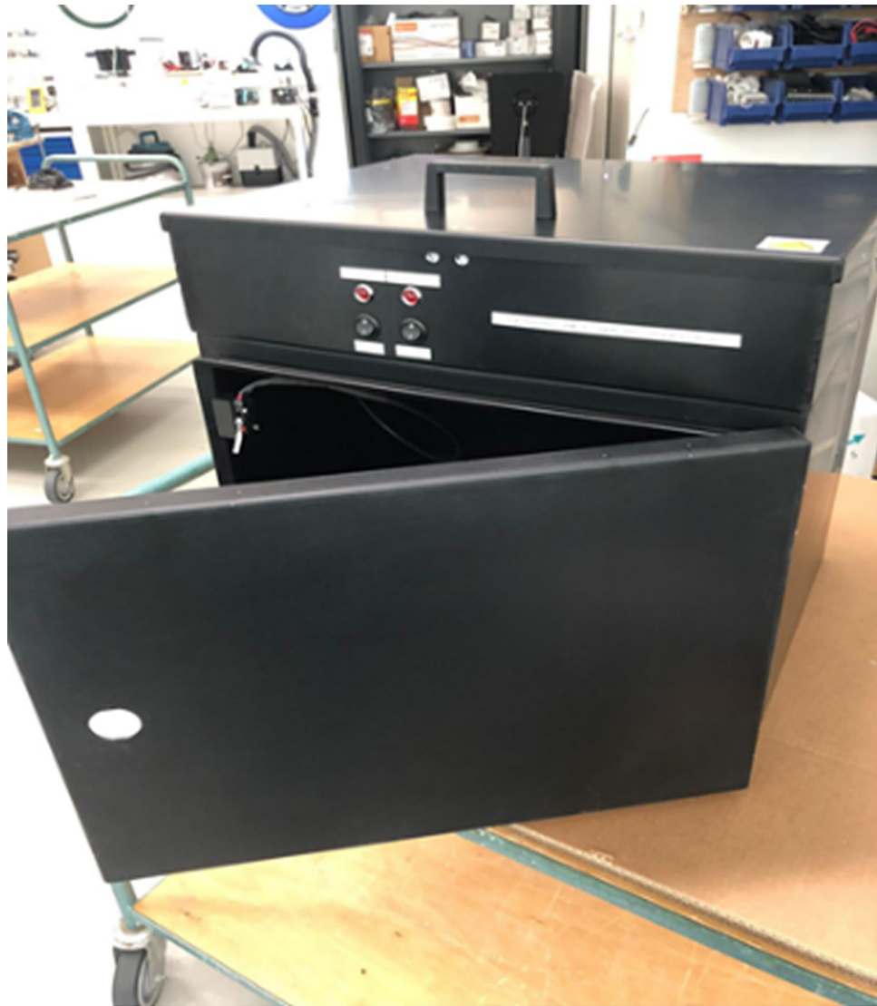
Figure 2. Prototype UV-C test apparatus.