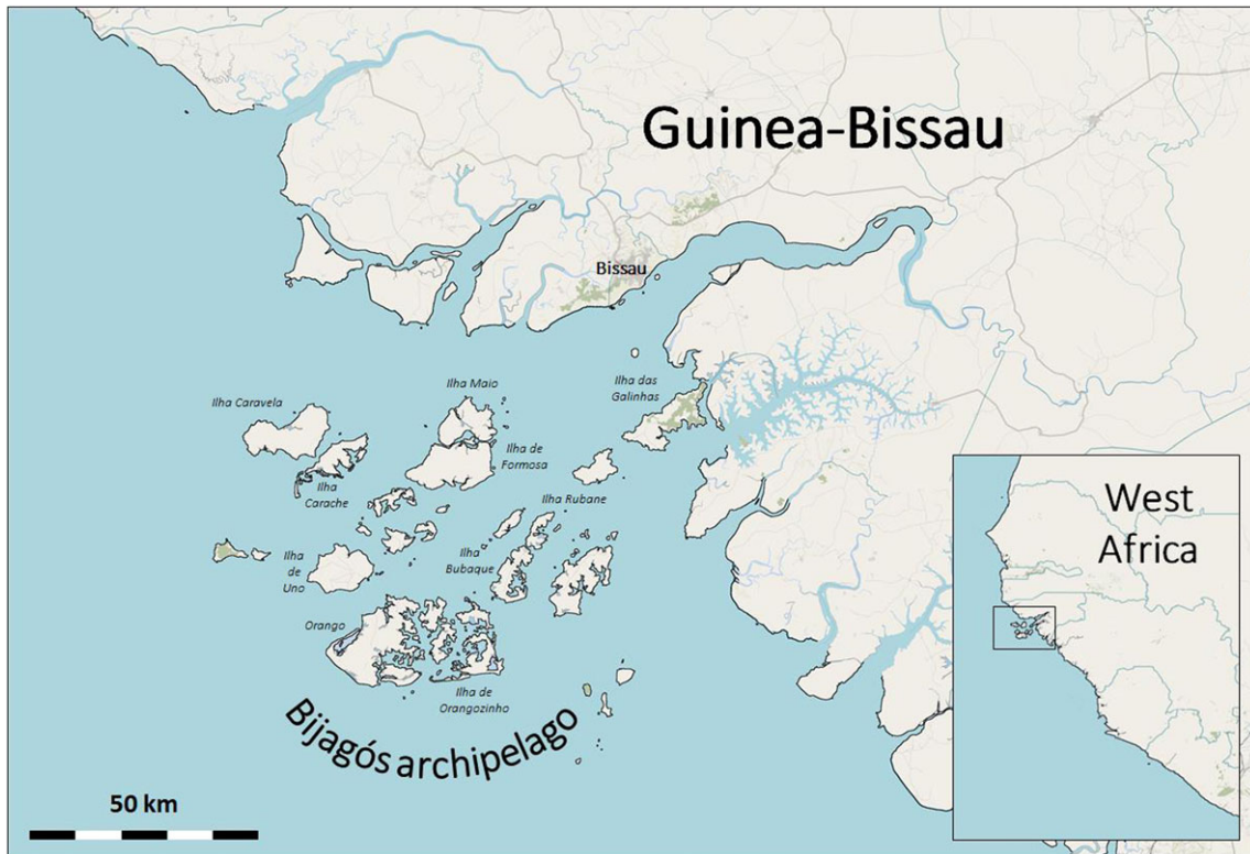
Figure 1. Bijagós archipelago, situated off the Atlantic coast of Guinea-Bissau. Inset shows position of Guinea-Bissau on the coast of West Africa. Adapted from OpenStreetMap. Credit: © OpenStreetMap contributors.

control strategies in general for population suppression. The island study was followed by sustained field releases in a suburb of Juazeiro, Bahia, Brazil. While reductions seen in ovitrap indices, compared with the adjacent no-release control area, were similar to those estimated in the Cayman trials [56], results from a large-scale release in Piracicaba have not been published in academic journals. Challenges in producing sufficient numbers of transgenic mosquitoes can limit the number released per hectare [46] and thus make it difficult to replicate successes in larger areas.