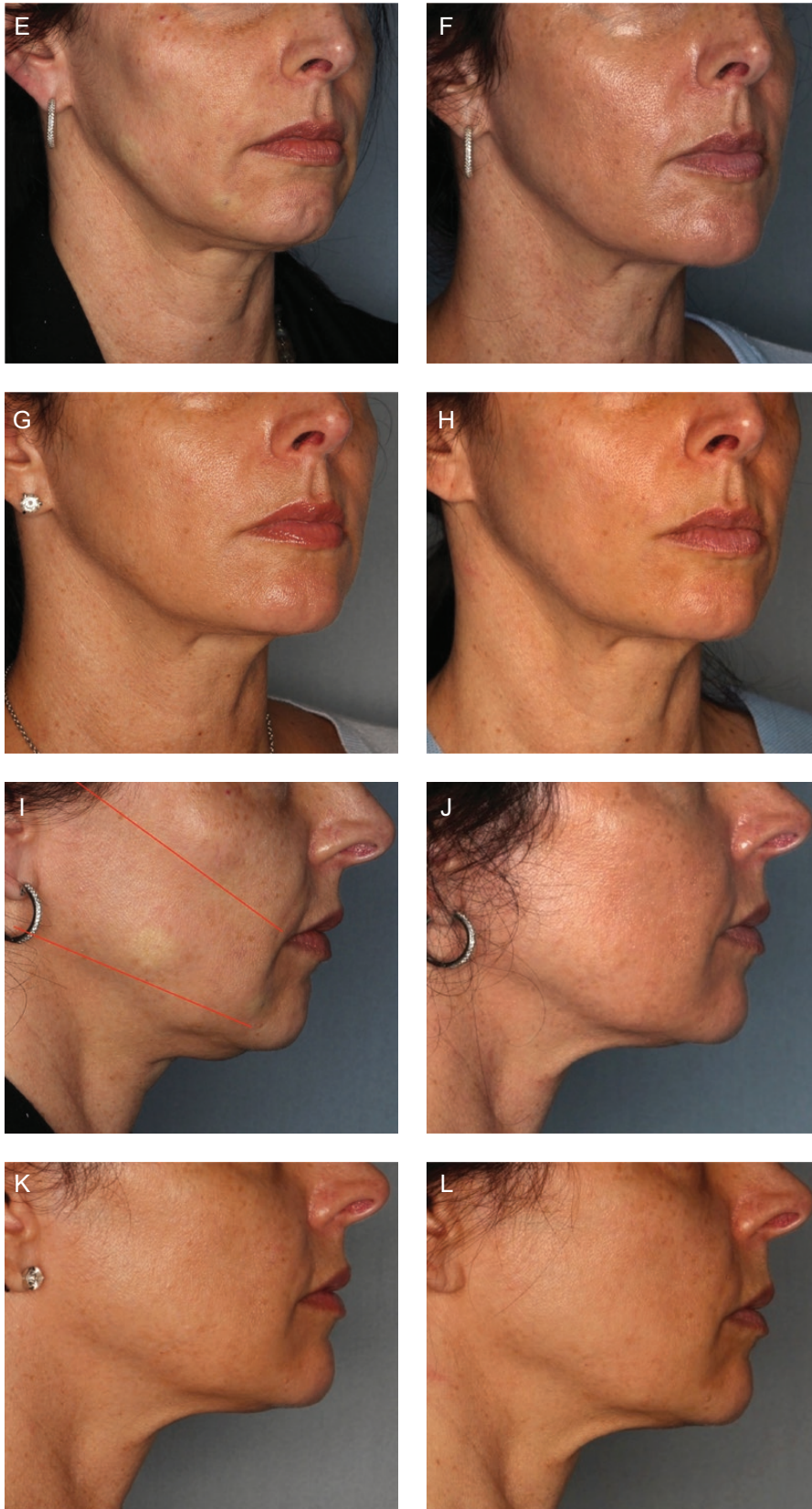
Figure 2. Continued