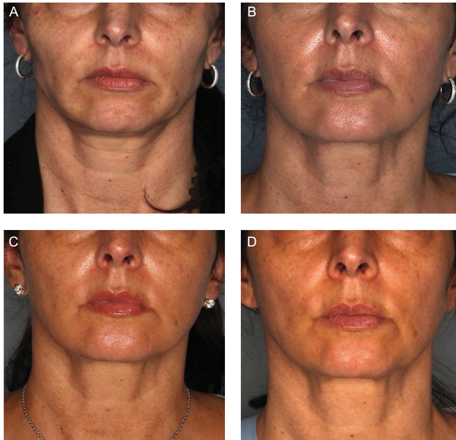
Figure 2. A 48-year-old female with moderate midfacial volume deficit with ptosis, moderate jowling, and submental laxity underwent placement of 2 sets of 8-cone sutures per side; one placed along the midface (nasolabial fold to temporal sideburn) in a vertical vector and the other placed along the jawline (marionette line to temporal sideburn) in a vertical vector. Follow-up photographs were taken at 6, 18, and 24 months (before second Silhouette procedure). (A) Preprocedure frontal view illustrating midfacial volume deficit and loss of inverted triangle of youth. (B) 6-month follow-up frontal view illustrating improved midfacial volume, improvement in midface ptosis, and reduction in submental laxity. (C) 18-month follow-up showing sustained improvement in midfacial volume, midface ptosis, and submental laxity compared to baseline. (D) 24-month follow-up prior to second Silhouette procedure displaying a continued improvement in overall facial appearance; second procedure performed with two sets of 8-cone sutures on each side, same location as first procedure, to augment results. (E) Preprocedure right three-quarter view illustrating moderate jowling. (F) 6-month follow-up right three-quarter view illustrating improved streamline of the jaw with jowl reduction. (G) 18- and (H) 24-month follow-up right three-quarter view demonstrating continued improved streamline of the jaw with jowl reduction as compared to baseline. (I) Preprocedure right profile view illustrating moderate submental laxity with suture placement indicated. (J) 6-month follow-up right profile view displaying improved submental laxity and tighter cervical-mental angle. (K) 18- and (L) 24-month follow-up right profile views demonstrating sustained improvement in submental laxity and tighter cervical-mental angle. The patient was also treated with neuromodulators in the glabella, crow's feet, upper forehead, and anterior hairline.

narcotics were unnecessary. In this 24-month follow-up study, there were no late-onset adverse events reported. Of note, the neck was most often treated in concert with the midface and/or jawline, and while the jawline and midface may be treated in isolation, they are often treated together. Thus, this study is not sufficiently powered to assess satisfaction based on the combination of areas treated.