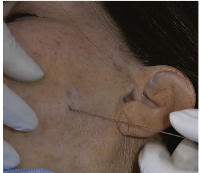
Video 1. Watch now at https://academic.oup.com/asjof/article-lookup/doi/10.1093/asjof/ojz029

that may be applied to surgery-naïve patients as well as patients who have already undergone a surgical intervention.