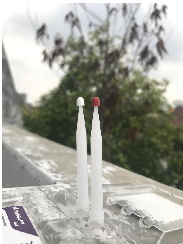
Figure 1 The VAMS Mitra® cartridge (2 samplers).

methanol or water (Protti et al, 2019). In addition, the preparation of VAMS samples is also easy because it only needs to separate the VAMS tip with the handle without having to cut out like a sub-punch method that must be applied to DBS samples. 11