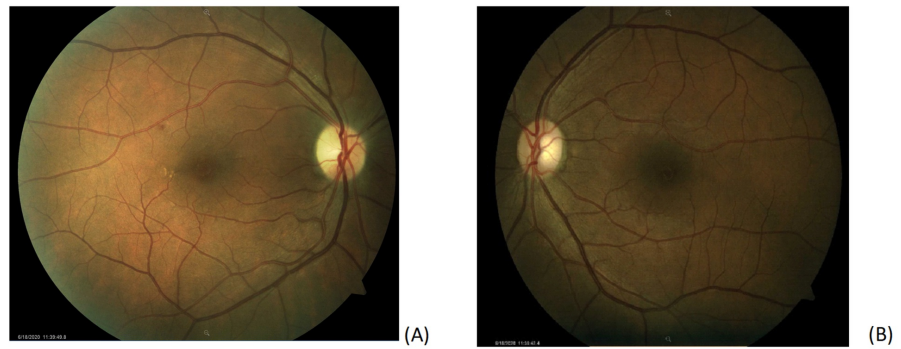
FIGURE 1: Color fundus photography of both eyes. (A) Fundus photo of the right eye showing a small microaneurysm with exudates along the superotemporal arcade without subretinal fluid and temporal pallor of the optic nerve. (B) Fundus photo of the left eye is normal with a cup-to-disk ratio of 0.3.

Humphrey visual field (HVF) 24-2 of the right eye revealed a dense inferior altitudinal defect that respects the horizontal meridian (Figure 2).