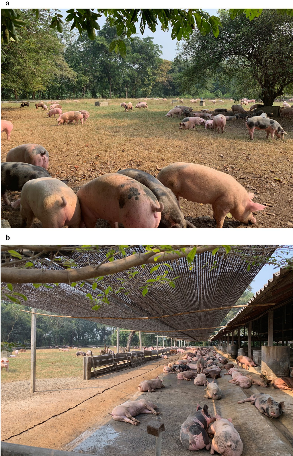
Fig. 1 Pigs in the outdoor area at the antibiotic free farm