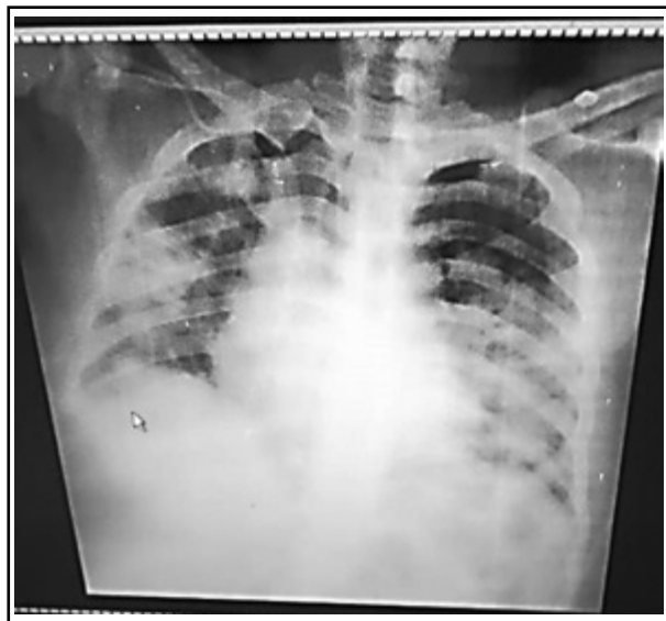
Fig.3 (a): 49 years old male patient chest X-ray on presentation showed right three zone and left two zone heterogeneous predominant peripheral opacities.