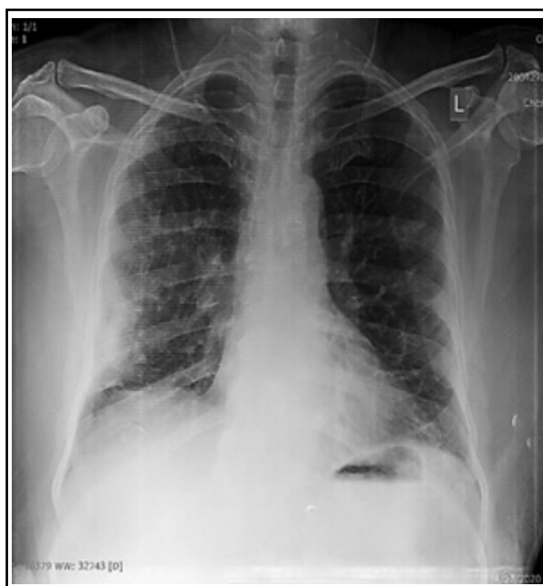
Fig.2: Right middle and lower zone peripheral opacity.