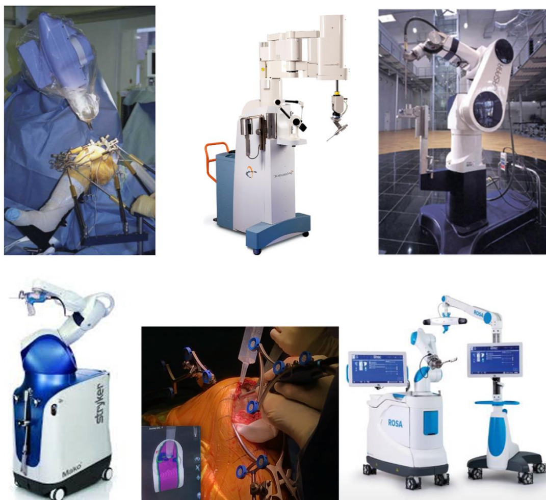
Figure 4. The autonomous and semiautonomous robotic systems incorporate safeguards against removal of bone beyond the 3D plan. The first three robotic systems are autonomous (Robodoc, Caspar). The last three robotic systems are semiautonomous (Mako, Navio, Rosa).

Three categories of robotic systems for knee arthroplasties exist: passive, semiautonomous, and autonomous robotic systems. A passive system provides a 3D virtual model, which allows accurate preoperative planning. But there is no system to prepare the bone. The autonomous and semiautonomous systems incorporate safeguards against the removal of bone beyond the 3D plan (Figure 4).