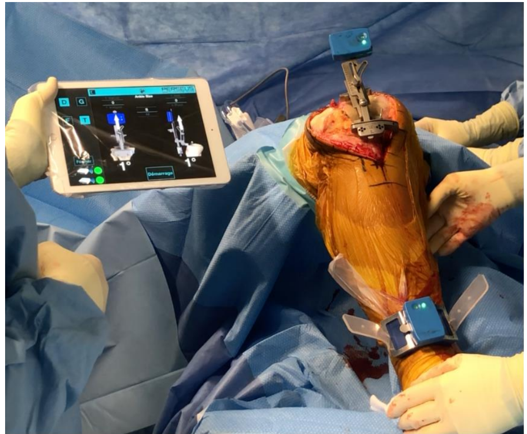
Figure 3. The accelerometer is a handheld device used within the operative field to determine the resection planes of the proximal tibia. This system guides resection angles in the coronal and sagittal planes (Perseus, Orthokey).