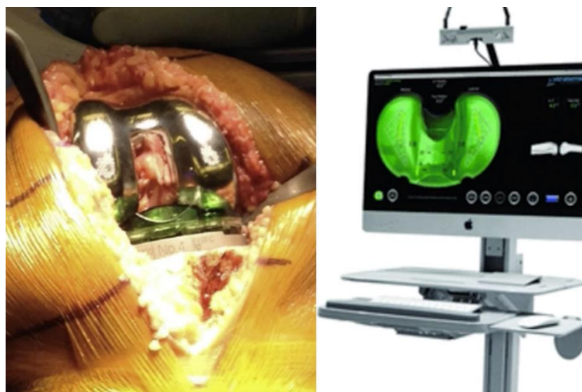
Figure 2. The sensor is an articular loading quantification device, which is inserted in the tibial component tray during the surgery, after the tibial and femoral cuts are completed (Orthosensor, Verasense).