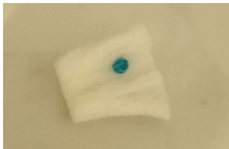
Figure 1 Menthol capsule located inside a filter.

flavour if inserted into factory-made cigarettes or packs of RYO tobacco. 38 39