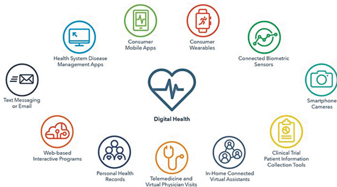
Fig. 1. Various tools for digital health. Adapted from IQVIA by the policies for data download and sharing [6].

Wristbands, belts, patch-type wearable devices, and smartphone sensors can be used to measure and evaluate an individual's activity (Table 1). Indicators such as activity amount, activity intensity, and calorie consumption are automatically estimated and transmitted to the user while using these devices. Previous studies show the high accuracy of these measurement device indicators [11,12]. Improvements in recently released equipment now enable the monitoring of cardiovascular dis-