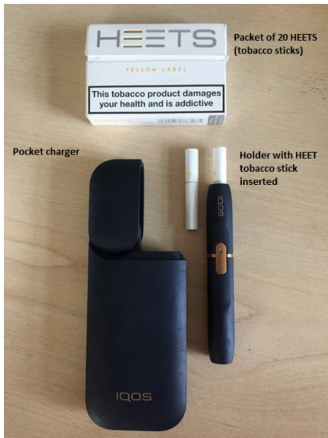
Figure 1 IQOS 2.4 Plus and HEETS tobacco sticks.

and to obtain a greater depth of data than could be generated from focus groups.