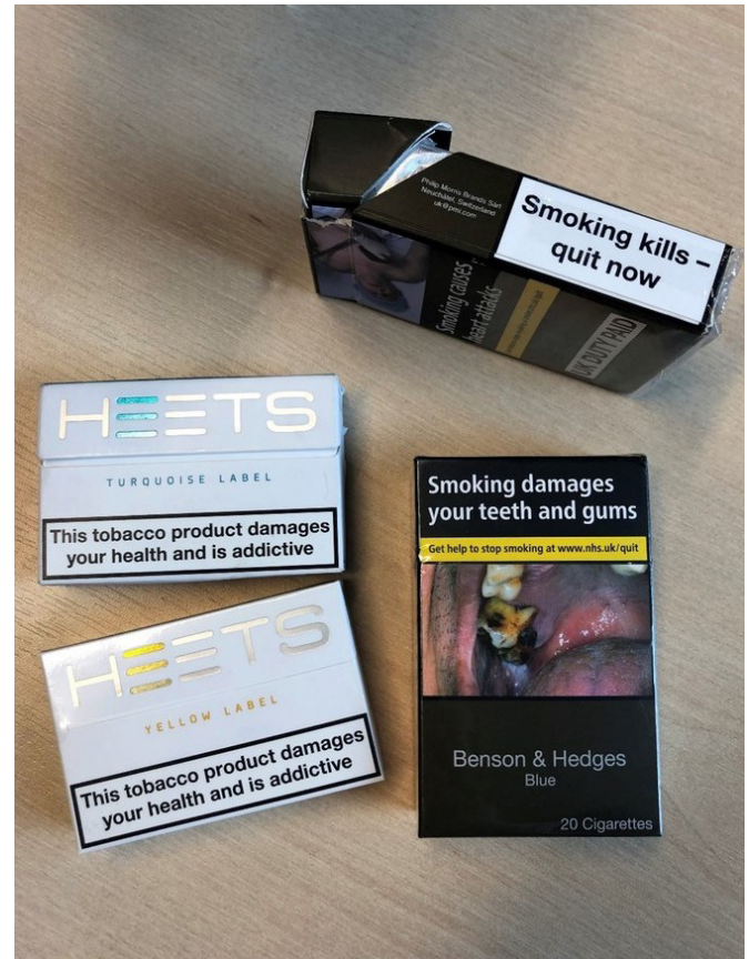
Figure 2 HEETS tobacco sticks and combustible cigarette packaging in the UK.

Iterative categorisation, a rigorous and transparent approach, guided data coding and analyses. 31 The authors read transcripts to familiarise themselves with the data, discussed the content, and developed a coding frame of deductive (based on areas included in the topic guide) and inductive (based on additional areas that arose during the interviews) thematic codes. The transcripts and the coding frame were imported into MaxQDA; CNET