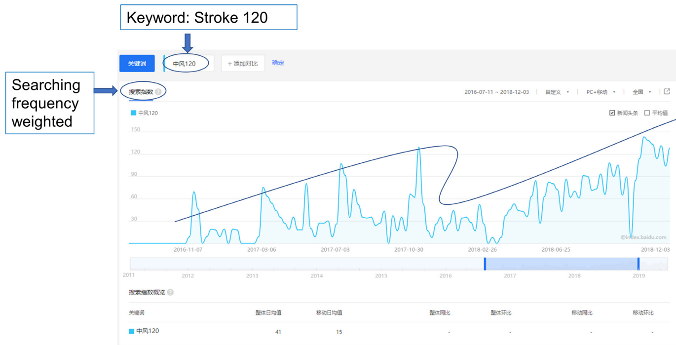
Figure 2 Searching weighted frequency of Stroke 1-2-0 extracted from Baidu Index from November 2016 to December 2018. As noted, there is no search of Stroke 1-2-0 in the early part of 2016; the search of Stroke 1-2-0 is gradually increasing over the period of 2016 to 2018, indicating an increase in interest.

centre authentication. The National Health Commission of the People's Republic of China announced on 10 October 2019 that Stroke 1-2-0 should be used as a key educational tool for stroke awareness activities for the 14 th World Stroke Day (29 October 2019).