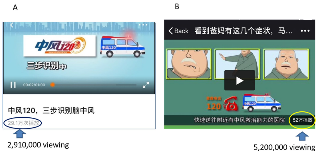
Figure 1 The educational videos for Stroke 1-2-0 have been watched over 200 million times on the websites during the first half year after their release. The left panel (A) indicates 2 910 000 viewings after 2 months of its release; the right panel (B) indicates 5 200 000 viewings on one of the hosting sites 1 month after its release. Such data indicate a general public interest spike on the awareness of stroke.

The general acceptance of Stroke 1-2-0 was evident through its massive media coverage. As soon as Stroke 1-2-0 was published in Lancet Neurology online on the World Stroke Day, 29 October 2016, the CSA endorsed and promoted it on the same day in its official World Stroke Day event in Beijing, followed by over 200 regional and national news reports including a special introduction on China Central Television (CCTV) on 29 October 2016. Within hours of its broadcast on CCTV, its Weibo (a social media platform in China, similar to Twitter), had over 101 million views of its introduction with very positive reviews. The education video about Stroke 1-2-0 was released on 14 February 2017. The public accepted it very well. Many hospitals started to promote it through their broadcasting systems. Several TV stations broadcast it multiple times a day. Figure 1 shows two examples. One video had 5 200 000 views on one of the hosting sites, Tencent (Tengshun) ( http://v.qq.com/ ), 1 month after its release. Many hospitals and television stations are broadcasting our Stroke 1-2-0 educational video repeatedly on a daily basis. An increasing trend for searching Stroke 1-2-0 was observed ( figure 2 ). It is also important to note that Stroke 1-2-0 is now written into stroke care guidelines in China and it should be an essential component for stroke