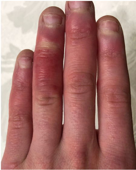
Fig. 1 Chilblain-like lesions of the fingers.