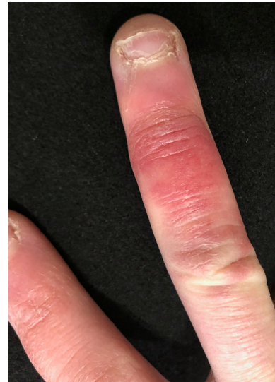
Fig. 2 Periungual chilblain-like lesions.

COVID-19 negative via PCR, and SARS-CoV-2 antibodies were negative. The authors noted that temperatures in Northern California were within the average monthly range for April, and not unseasonably cold. They concluded with an additional report of 24 cases of acral lesions appearing in adolescents aged 10 to 19 in the Bay Area, 13 of whom tested negative for COVID-19 infection via PCR. These authors add to the knowledge of the COVID toes by demonstrating the spread among siblings and the delay of infection by 1 week. There is some suggestion from these data that COVID toes may relate to a genetically transmissible response to COVID-19.