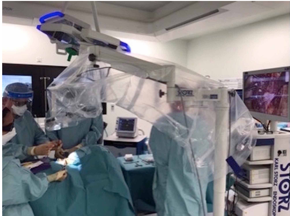
FIGURE 1: Position of the VITOM® 3D exoscope system in the operating theatre

The procedure was carried out with the patient in a supine position on a head ring and shoulder roll. The exoscope, within a sterile drape, was placed 50 cm from the patient to the right of the surgeon and outside the line of sight. It projected to a 3D monitor, placed 2.5 m from the surgeon, positioned at eye level directly opposite the operating surgeon. The control panel was placed to the left of the surgeon within reach, allowing adjustment of focus and fine position of the field of view. The scrub nurse was positioned at the head and the anaesthetist at the foot of the bed. (Figure 1, 2)