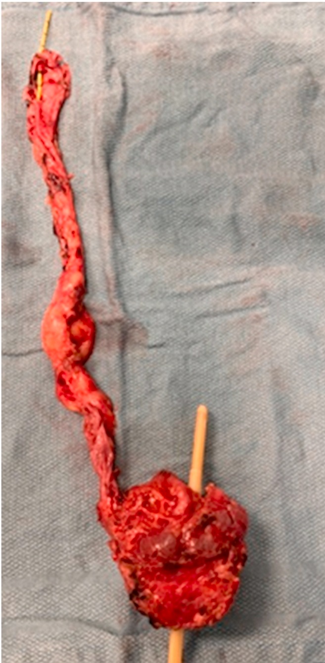
Fig. 3. Posterior view of the excised specimen: Ectopic ureter inserted into the prostatic urethra.