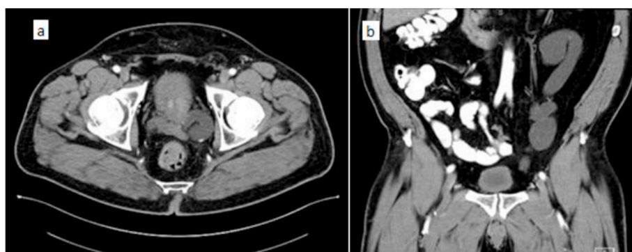
Fig. 1. Preoperative CT scan: (a) axial image showing dilated left ectopic ureter twisting behind the prostate and (b) coronal image showing left upper pole hydronephrosis.

Alexander Cranwell: Conceptualization; Validation; Writing -