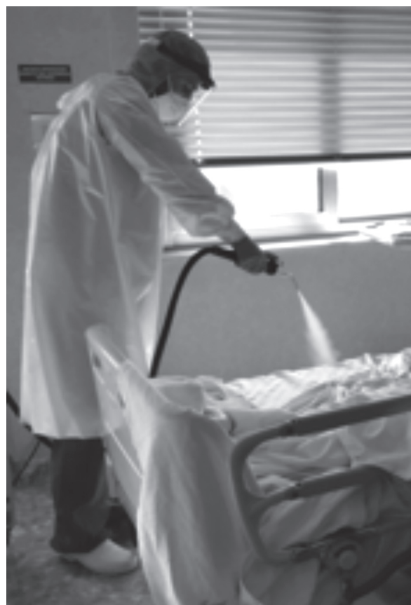
Figure 1 - Surface sanitization procedure

ordinary sanitization procedures and 12 after extraordinary sanitization procedures. One surface sample from an administration office was obtained outside the unit as a control sample. Eight samples were obtained from PPE: four from the inner layer of two