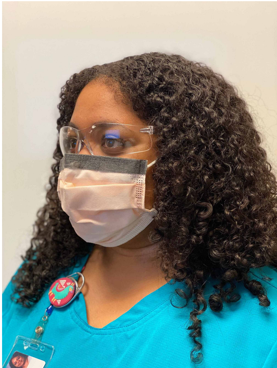
FIGURE 2: Safety Glasses

Though much is left to be determined regarding the novel coronavirus--especially its ophthalmic implications--the tremendous efforts of researchers in the last several months have provided us with some level of clarification as to the manifestation of the disease in the eyes and the level of precaution we must take in order to prevent the further transmission of the virus. Evidence of ophthalmic transmission of past coronavirus strains implores an investigation into the ability (virulence) of and mechanisms by which the novel coronavirus to spread through the eye. In addition to the presentation of conjunctivitis in several COVID-19 patients, the presence of viral particles on surfaces and within respiratory droplets, other aerosols, and ocular secretions poses a much more threatening means of ophthalmic transmission of SARS-CoV-2 than has previously been considered. Additional exploration may better and more specifically inform preventative practices. Nonetheless, health care workers should be aware of the appropriate usage of PPE for optimal prevention of disease transmission, particularly as it relates to ocular health and infection] [10]. Figures 2, 3, 4 illustrate appropriate donning of eye protection.