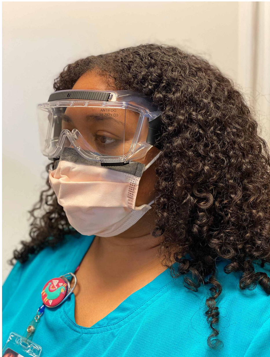
FIGURE 3: Safety Goggles