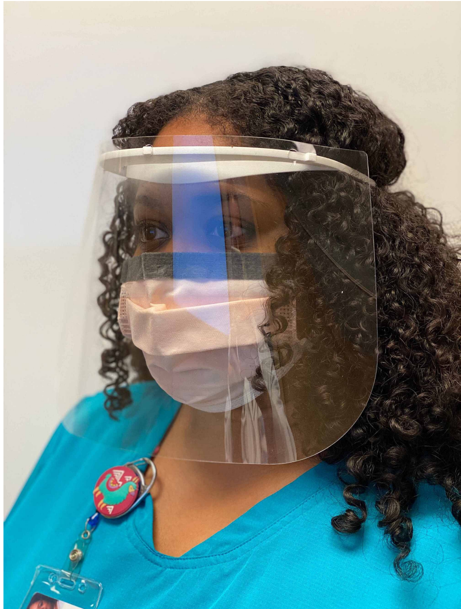
FIGURE 4: Full Face Shield

This case report builds on previous work that has found infection by SARS-CoV-2 can produce an inflammation of the conjunctiva, which leads to redness and itchiness of the eyes. Conjunctivitis appears to be the most prevalent ophthalmic manifestation of the disease and could potentially be one of the first symptoms of the virus. However, it has been demonstrated that patients infected with SARS-CoV-2 have presented with signs of blepharitis including lid margin hyperemia and/or telangiectasia, crusted eyelashes, and meibomian orifices alterations, potentially owing to the ability SARS-CoV-2 to alter the microenvironment and destabilize the tear film on the ocular surface epithelial cells and glands [11]. Without further research on the ocular symptoms related to SARS-CoV-2, it is possible that the virus could be overlooked in its early stages and the symptoms may be misidentified as more common causes of conjunctivitis (such as an allergic reaction or bacterial origin) rather than manifestations of the infection.