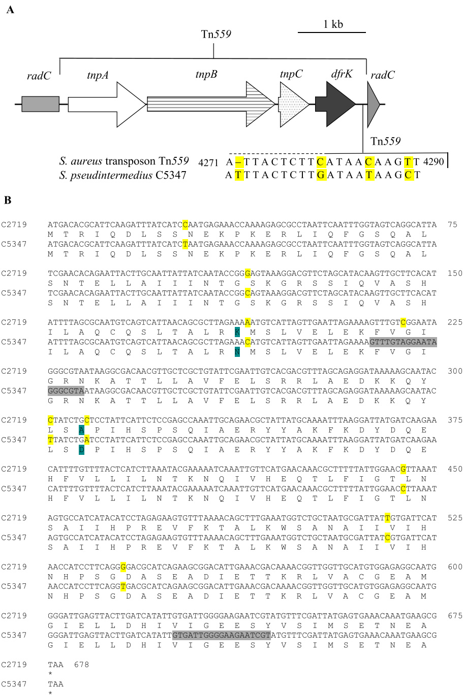
Fig. 2 a Graphical representation of the Tn559 structure containing the dfrK gene integrated in the chromosomal radC gene of the isolate Staphylococcus pseudintermedius C5347 (GenBank accession number MT252966) and nucleotide substitutions detected in the non-coding region downstream the dfrK gene compared to Staphylococcus aureus transposon Tn559 (GenBank accession number FN677369). The nucleotide positions are set based on the whole Tn559. Nucleotide insertions and substitutions are colored in yellow. b Amino acid sequence alignment of radC gene and resultant RadC of Staphylococcus pseudintermedius strain C2719 (GenBank accession number HF679552), where transposon Tn558 was integrated, that of S. pseudintermedius C5347 (GenBank accession number MT252966). The position of the primer pair employed is indicated in grey. Nucleotide substitutions are colored in yellow and amino acid substitutions in blue