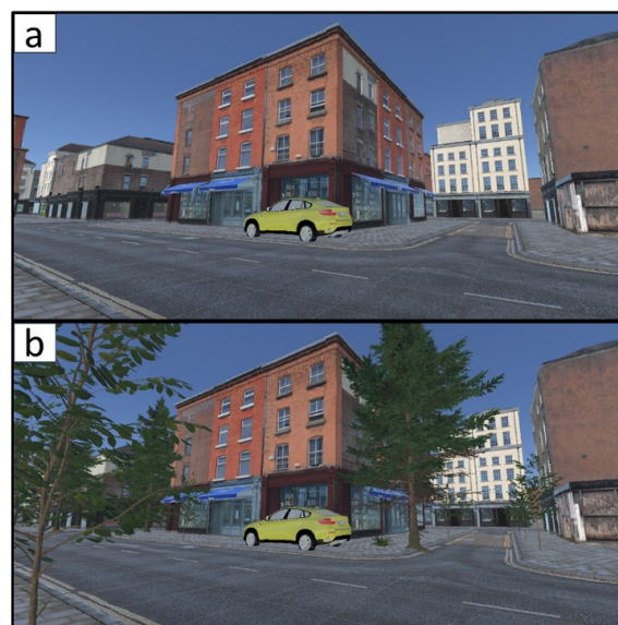
Figure 2. A 2-D view of the immersive virtual environment (IVE) extracted from near the starting point of the experiment. (a) control condition (no greenery); (b) green condition. The two environments are identical other than green elements that were used in the second environment. Pupil fixation on the yellow car that appears in the images was recorded using the VR headset’s eye-tracking sensor.