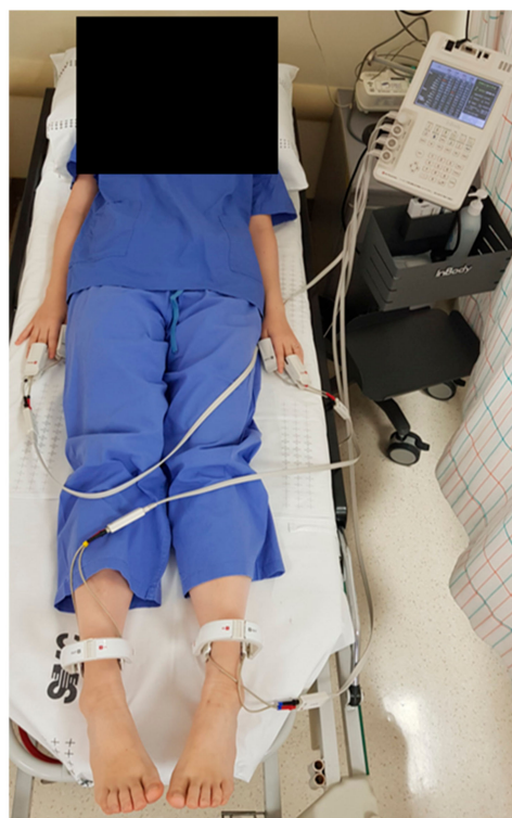
Figure 2. Whole-body bioelectrical impedance analysis measurement.