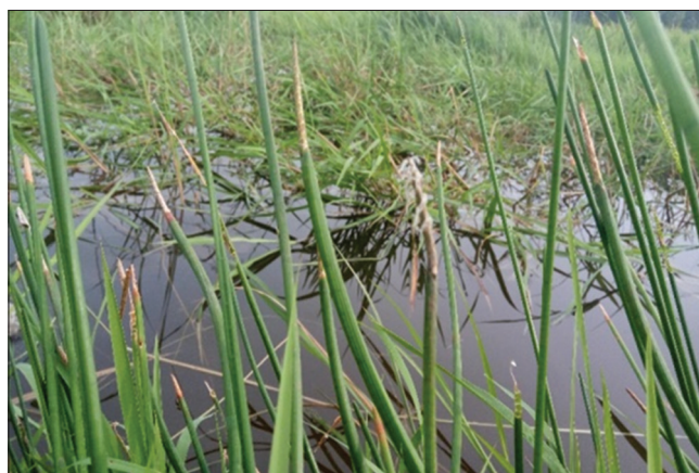
Figure 1: Chinese water chestnut ( Eleocharis dulcis )

The results of Anisah et al. , [13] analysis of chemical components with gas chromatography-mass spectrometry showed that the most active extracts of ethanol extract on Jabon leaves contained phenolic compounds (quinic acid, catechol) and fatty acid derivatives (hexadecanoic acid) which had potential antidiabetic activity. Quinic acid phenolic compounds have antidiabetic activity in