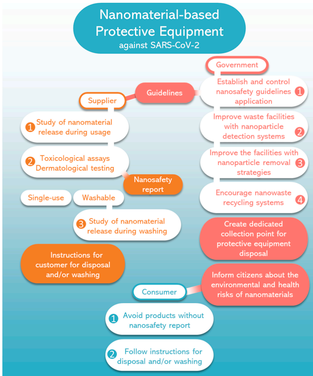
Scheme 1. A step-by-step guide for interventions and behavior related to the use of protective equipment based on nanomaterials.

containing textiles release significant amounts of dissolved and particulate silver depending on the manufacturing processes and on the use of ultrapure water or tap water for washing, which is less aggressive [9].