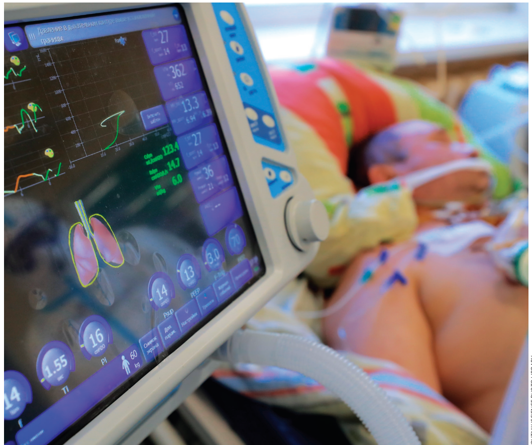
A person with covid-19 connected to a ventilator in Tver Regional Clinical Hospital, Russia

And third, the virus hasn’t needed to evolve in order to be successful. Not yet, anyway. This is what makes some virologists