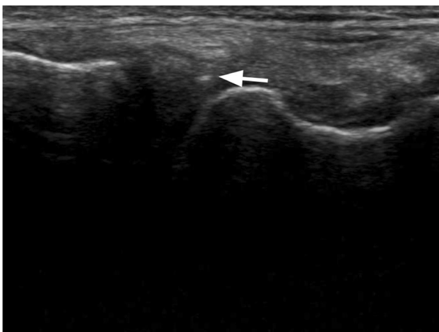
Fig. 3 Needle tip visualized in an out-of-plane view for MFAT injection into the meniscus under ultrasound guidance

This study demonstrated that MFAT injected directly into meniscal tears following trephination of the tear along with a joint injection under direct ultrasound guidance represents a safe and clinically significant treatment option for patients with degenerative meniscus tears and knee osteoarthritis (Fig. 3). Additionally, the study suggests that improvement in knee pain and function scores may be sustained for up to one year. This information can help guide the development of a larger, randomized, controlled trial to determine the efficacy of MFAT. Inclusion of pre- and post-surgical MRI and other