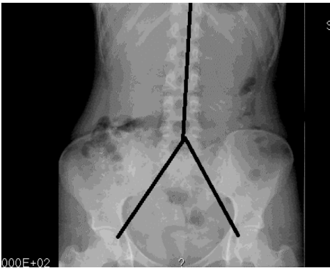
Figure 2 Colon transit study in a healthy control. Subjects ingested the 24 markers for 6 d, and an X-ray was acquired on day 7. From the X-ray we counted the number of markers in each segment: 11 + 6 + 1 = 18 ; faecal load score: 2 + 1 + 1 = 4 (see text).

We used linear regression model to examine associations between markers and faecal load. Data from patients' radiographs at 48 h and 96 h revealed significant associations between markers and faecal load ( P < 0.001 ). These parameters showed the same relationship patterns among controls.