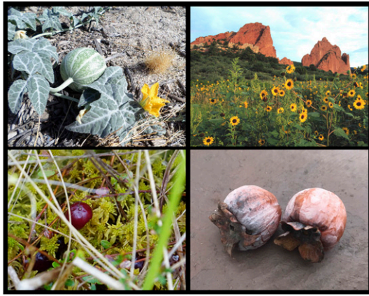
Fig. 1. Photos of four native CWR from the United States: Cucurbita palmata, wild Helianthus annuus, Vaccinium oxycoccos, and Diospyros virginiana.

targeting 1A taxa, particularly in their geographical hotspots of the Midwest to Mid-Atlantic and northwest coast.