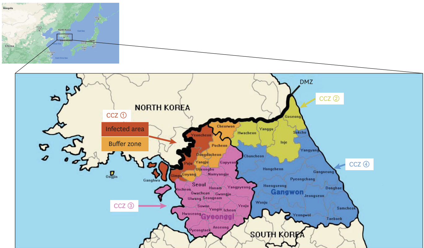
Fig. 1. Four CCZ. The MAFRA of Korea has established four CCZ in Gyeonggi province and Gangwon province to separate infected region and their vicinity. Pigs, manure, and related vehicles were allowed to move only in each CCZ to prevent the spread of African swine fever virus to other areas. CCZ 1, Northern zone of Gyeonggi province including infected area (red, four cities/counties; Yeoncheon, Paju, Gimpo, and Ganghwa), buffer zone (orange, five cities/counties; Cheorwon, Pocheon, Dongducheon, Yangju, and Goyang,) and Ongjin (yellow); CCZ 2, Northern zone of Gangwon province (green); CCZ 3, Southern zone of Gyeonggi province (pink), CCZ 4; Southern zone of Gangwon province (blue). CCZ, critical control zone; DMZ, demilitarized zone.

Persons who had contact with pigs, such as veterinarians, insemination technicians, the business people of a feed company, and others, were not allowed to visit pig farms in Gyeonggi and Gangwon provinces except for the treatment of sick animals in farms. The 2 nd enforced control measures focused on the separation of infected regions and their vicinity in Gyeonggi and Gangwon provinces into four 'critical control zones (CCZ)': Northern zone of Gyeonggi, Northern zone of Gangwon, Southern zone of Gyeonggi, and Southern zone of Gangwon ( Fig. 1 ). Pigs, manure, and related vehicles were allowed to move only in each